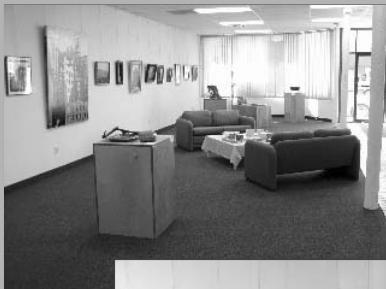
Views of the 716 Gallery

Please include a SASE if you will not be able to pick up your images after the committee's review. In addition to the above mentioned hours, other arrangements for delivery may be made by calling the office and leaving a message. Our aim is to accommodate participating members as much as possible.